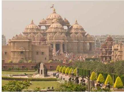
Swaminarayan Akshar Dham Temple, Delhi