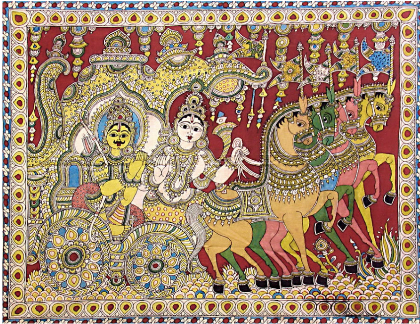
Srikalahasti : a style of Kalamkari work which involves dyed hand- painting of a fabric.

Started originally in the Sāsani era in Iran (almost 2500 years ago), there are two distinctive styles of kalamkari art in India – the Srikalahasti style and the Machilipatnam style.