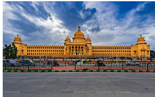
Bangalore Vidhana Soudha