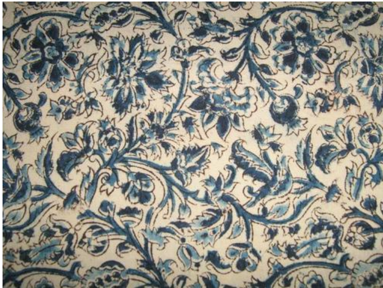
Machilipatnam: a style of Kalamkari work which involves vegetable dyed block-painting of a fabric.

The rich cultural diversity of India is well reflected in the vivid, distinct and enchanting folk art and crafts. Various painting styles like Kalighat, Phad, Gond, Pichwai are prevalent across various regions, each representing tradition, customs, and ideologies passed on from one generation to other.