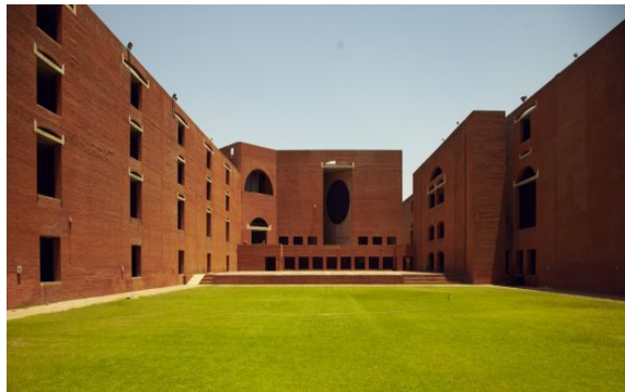
Indian Institute of Management,