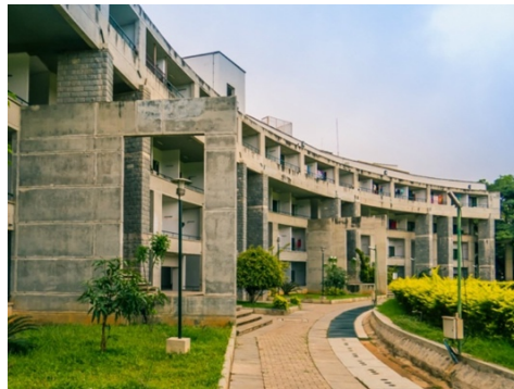
Indian Institute of Management, Bangalore