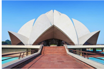
Lotus Temple, Bahai House of Worship,