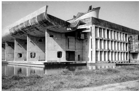
Chandigarh Assembly Building

Here are some of the important examples of post-independence architecture of India