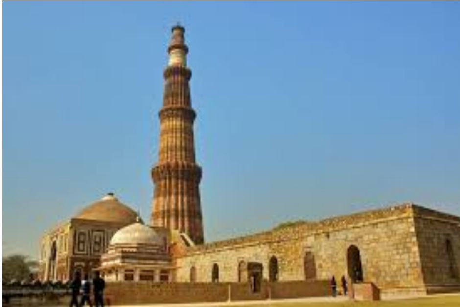
The Qutub Minar – the world's tallest brick minaret

The earliest buildings of this period are the Quwwat-ul-Islam Mosque at Delhi and the Qutub Minar. The latter is a five-storeyed tapering tower whose height is over 70 metres. There are beautiful engravings of calligraphy both in the mosque and on the tower. Many other buildings were later constructed by the Sultans. Alauddin Khalji enlarged the Quwwat-ul-Islam mosque and built a gateway to the enclosure of the mosque. This gateway, called the Alai Darwaza, is an extraordinarily beautiful structure even today. Decorative elements were used to make the building outstanding in its beauty. Alauddin Khalji also built the Hauz Khas in Delhi which was a hydraulic structure.