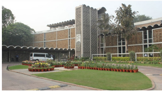
India International Centre, Delhi