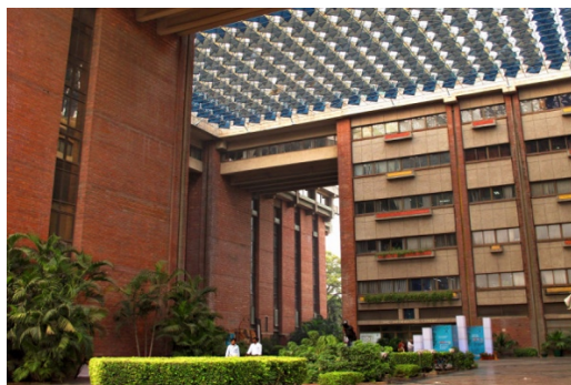
India Habitat Centre, Delhi