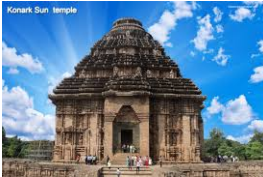
The Konark Sun temple

the most beautiful temples such as the Lingaraja temple built by the Ganga rulers, the Mukteshwara temple at Bhubaneswar and the Jagannath temple at Puri.