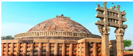
The Sanchi Stupa

In the 6 th century BC, India entered a significant phase of her history. There arose two new religions – Jainism and Buddhism, and even the Vedic religion underwent a change. The emergence of Buddhism and Jainism helped in the development of an early architectural style. Buddhist Stupas were built at places where Buddha's remains were preserved and at the major sites where important events in Buddha's life occurred. Stupas were built of huge mounds of mud, enclosed in carefully burnt small standard bricks. One was built at his birthplace Lumbini; the second at Gaya where he attained enlightenment under the Bodhi Tree, the third at Sarnath where he gave his first sermon and the fourth at Kushinagar where he passed away attaining Mahaparinirvana at the age of eighty.