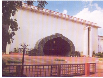
Vigyan Bhawan, Delhi